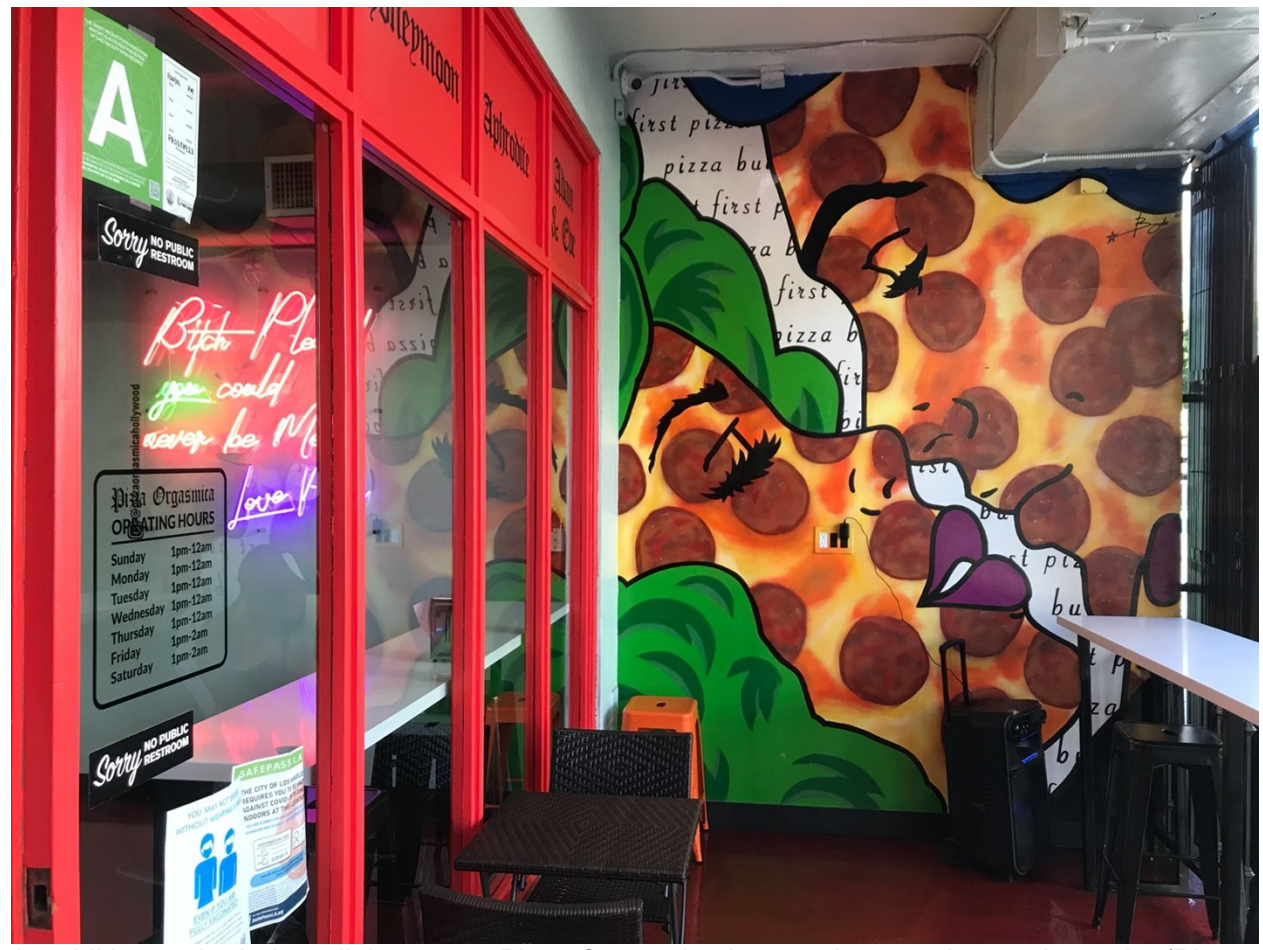
In addition to the indoor dining room, Pizza Orgasmica has outdoor seating on the patio.

Customers who choose to create their own pizzas have the choice of two different crust styles: a 6"x9" Sicilian thick crust ($10.00), or a 14" Large thin crust ($16.00). There is an impressive assortment of toppings to choose from: six cheeses, seven sauces, twelve meats (plus shrimp), and twenty-one vegetables. Each topping adds $1.50 to the price of the 6"x9" Sicilian, or $3.00 to the 14" Large.