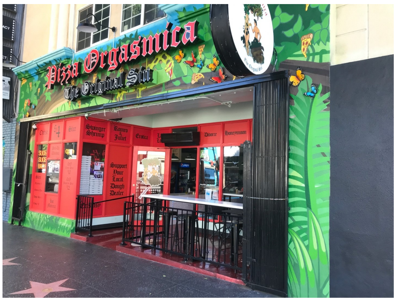
Pizza Orgasmica is located at 6338 Hollywood Boulevard.

Taking over the space formerly occupied by Combo's New York Pizzeria, Pizza Orgasmica had its grand opening on December 3, 2021.