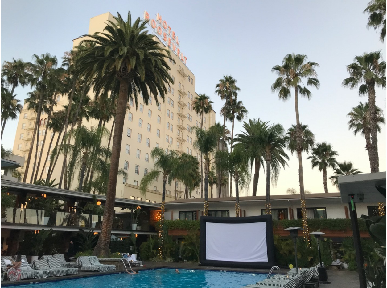
The Movie Nights at the Hollywood Roosevelt are at the Tropicana Pool.

The famed Movie Nights at the Hollywood Roosevelt occur every Monday at the Tropicana Pool of the historic hotel at 7000 Hollywood Boulevard. Ticket holders can make their way to the pool from the building's front entrance or the valet parking lot. The iconic Tropicana Pool features an underwater mural painted by David Hockney, and provides a unique screening experience under the neon sign of the hotel.