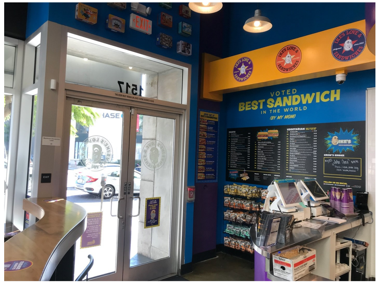
The store offers many different types of sandwiches: meat, vegetarian, vegan, halal, and glutenfree.

Ike's Love & Sandwiches is a unique quick service restaurant that recently opened on Vine Street, just north of Sunset Boulevard. It is located on the world-famous Walk of Fame, close to the Montalbán Theatre, a venue known for its rooftop movie screenings. The store differentiates itself through its incredible selection of sandwiches, and personalized branding. This new tenant will appeal to hungry locals and tourists seeking lunch or dinner while visiting the famous intersection.