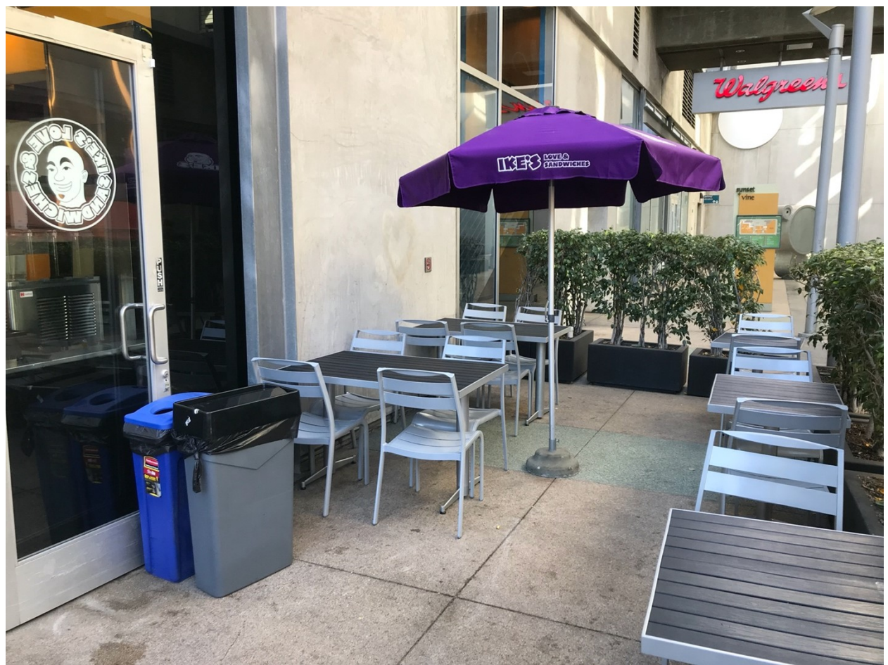
In addition to the indoor stand-up dining room, Ike's Love & Sandwiches has outdoor seating on the patio.

Ike's offers over 800 sandwiches, all of which are available for in-store purchase. The menu at the Hollywood location lists twenty-eight for meat lovers, and seventeen for vegetarians. Menu items with heart icons are "Ike's Favorites."