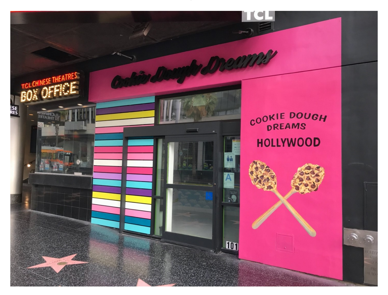
The new Cookie Dough Dreams is located at 6801 Hollywood Boulevard Suite 101, which is adjacent to the TCL Chinese Theatres box office.

The Hollywood store is the company's second location. The eye-catching storefront features pastel-colored paints and an image of two crossed wooden spoons filled with cookie dough. The interior has a fun, youthful vibe to bring out the inner child in people of all ages. Floor space is minimal, but there is a padded bench seat designed to look like an ice cream sandwich.